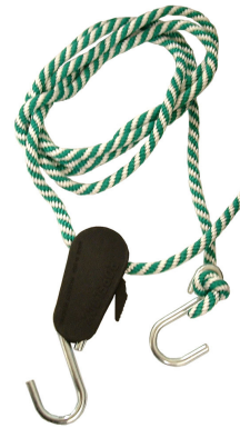
Dottie Part # RTL10