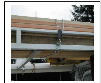
A Wide Variety of Uses

Comes in Handy Clamshell Pack For Easy Display and Merchandising